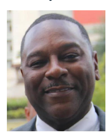
Ron McClain Institute of Mental Hygiene