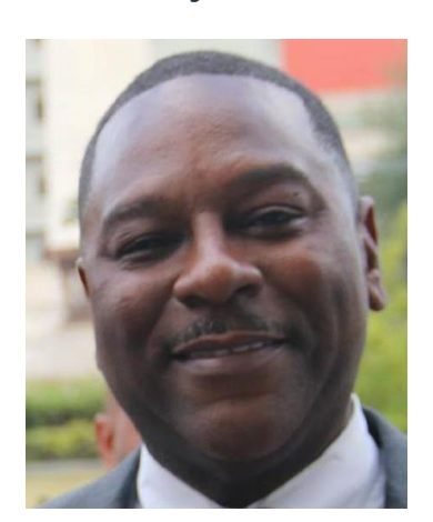
Ron McClain Institute of Mental Hygiene